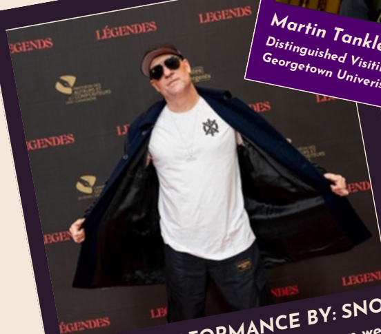
SPECIAL PERFORMANCE BY: SNOW 1992 hit single "Informer" spent seven weeks at #1 on the US Billboard Hot 100